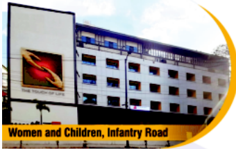
Women and Children, Infantry Road