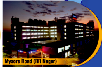
Mysore Road (RR Nagar)